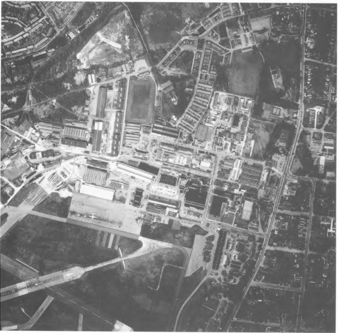
Aerial view of the Royal Aircraft Establishment in the mid 1960s, showing the runways and aircraft hangars of Experimental Flying Department and other Flights to the upper left, (South), of the Establishment.

at that time, which ranged from Accident Investigation to Hydraulics (General.) Most sections had fifteen or more members, including a Principal Scientific Officer or Principal Technical Officer as leader. Staff were given the minimum information necessary to allow them to carry out their task and forbidden to discuss work with anyone outside their section.