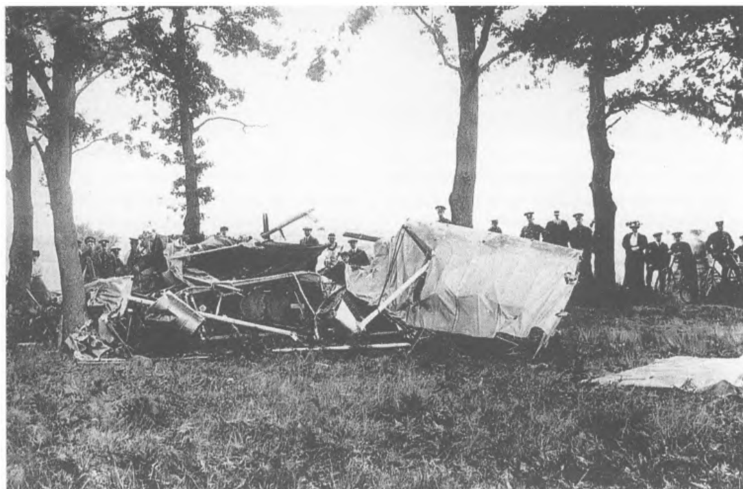
The scene of Cowdery's fatal crash on August 7th, 1913. The aircraft collapsed in mid air at 250 ft due to lack of structural strength.