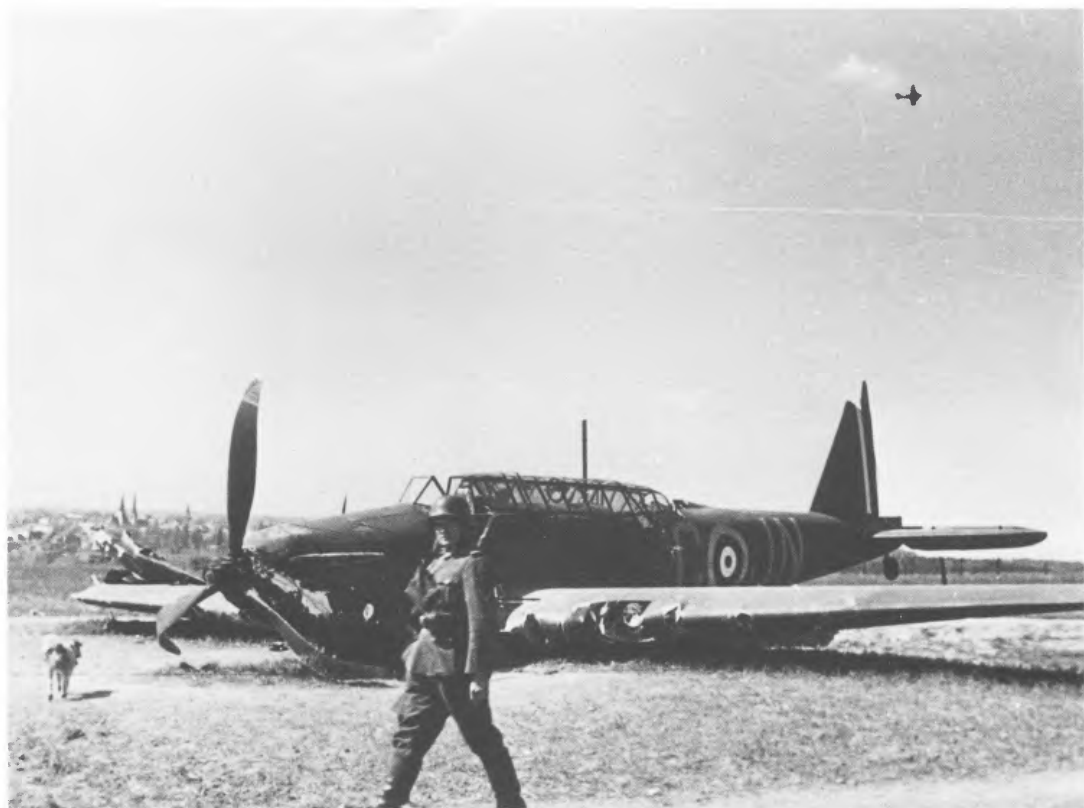
A Fairey Battle shot down in German occupied France. One hopes the crew survived as well as the aircraft.