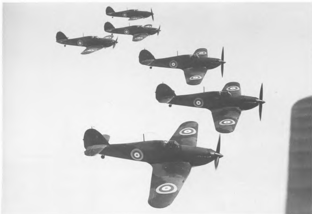
A flight of Hawker Hurricanes, the most effective British aircraft in the Battle of France